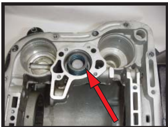
Fig. #3 Remove Spring(s) Do Not Reinstall!