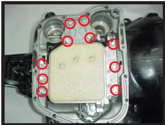
Fig. #1 Remove Ten Bolts

FEATURES: THIS VALVE BODY HAS BOTH MANUAL AND AUTOMATIC FEATURES WITH STOCK PATTERN (PRND21) AND HAS MANUAL LOW ANY SPEED!