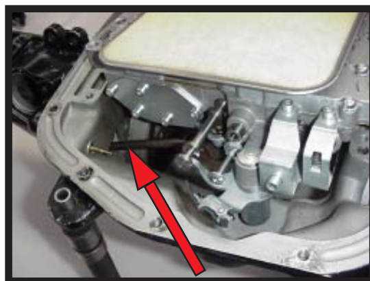
Fig. #2 Park Rod