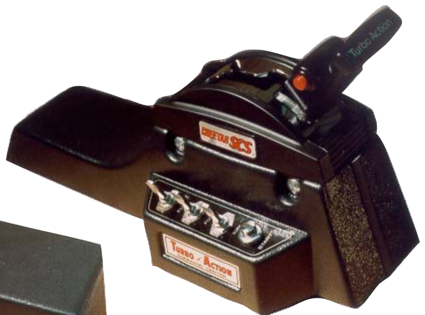
Fig. #3 Chrysler Shifter