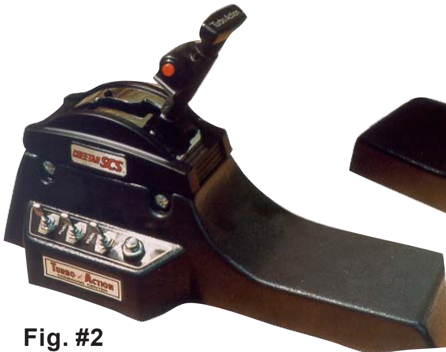
Fig. #2 G.M. & Ford Shifter