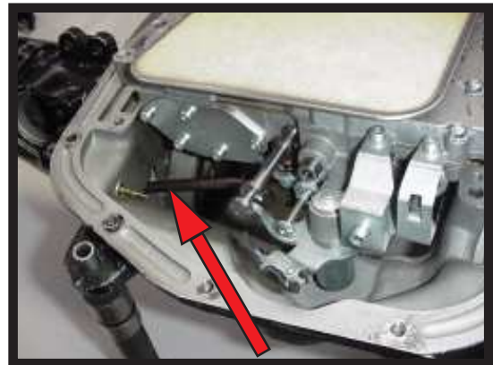
Fig. #2 Park Rod