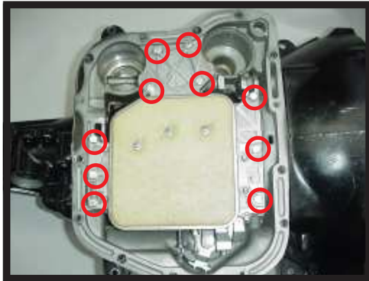
Fig. #1 Remove Ten Bolts

FEATURES: THIS VALVE BODY HAS BOTH MANUAL AND AUTOMATIC FEATURES WITH STOCK PATTERN (PRND21) AND HAS MANUAL LOW ANY SPEED!