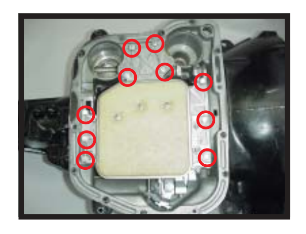
Fig. #1 Remove Ten Bolts

Caution: STOCK PATTERN (PRN321) AND HAS MANUAL LOW ANY SPEED!