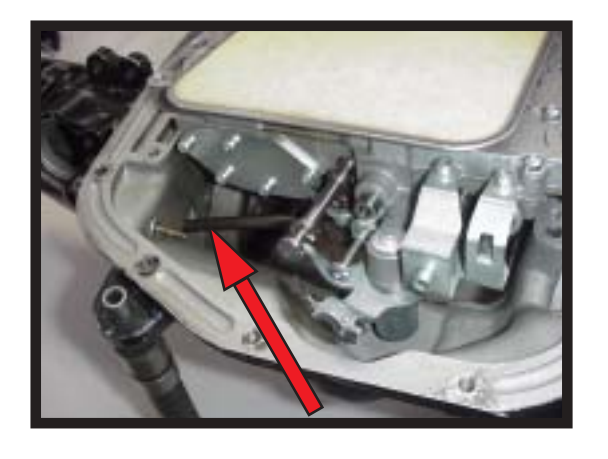
Fig. #2 Park Rod