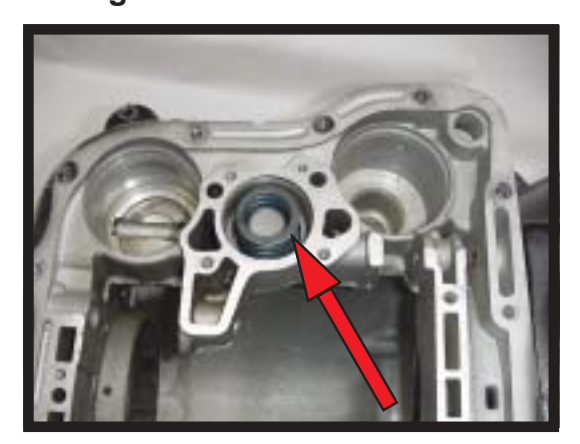
Fig. #3 Remove Spring(s) Do Not Reinstall!